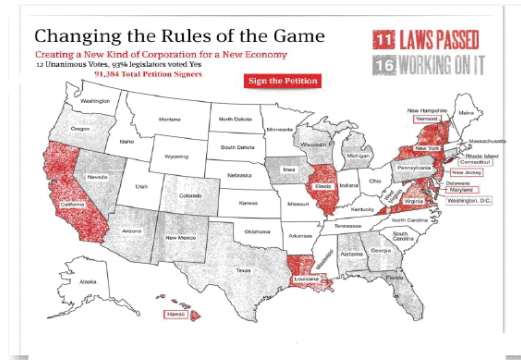
B Corps are a powerful constituency for systemic change

the change we seek™ B Corporations - Legislation - Impact Investing